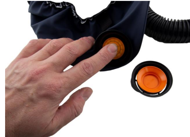
4.3 Press the new membrane onto the pin. Carefully check that the membrane is in contact with the valve seat all way round.