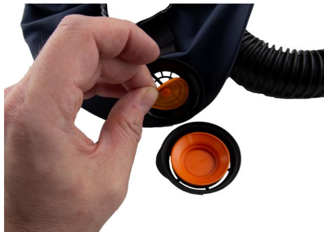
4.2 Slip off the membrane.