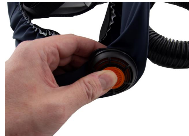
4.4 Press the valve cover into place. A clicking sound indicates that it is in place.