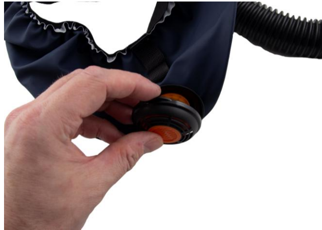
4.1 Snap off the valve cover.