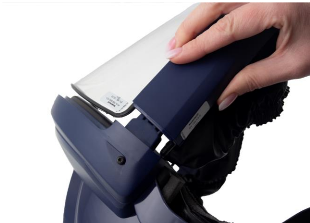
5.2 Remove the lower visor frame