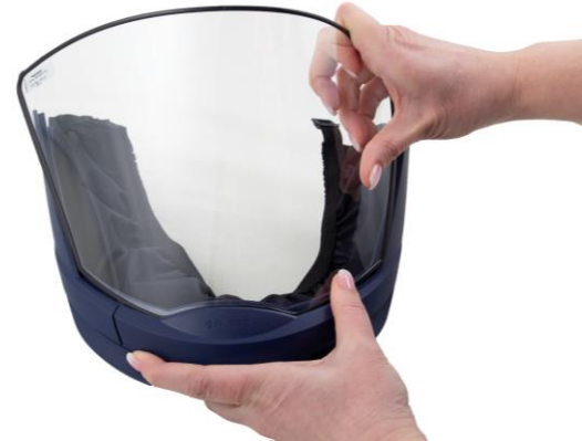
5.3 Remove the visor