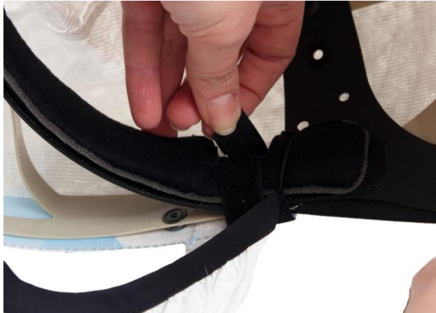
4.1 Remove the Velcro tapes.