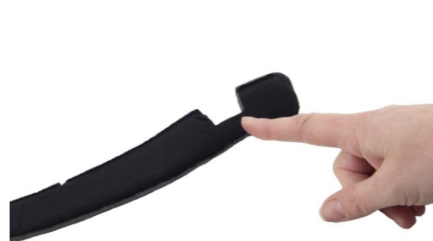
4.4 Fit the Velcro tape with the rough side towards the forehead band and the notch at the top.