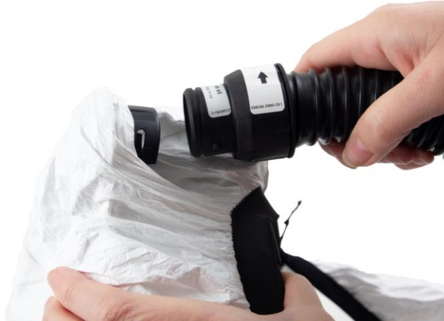
5.1 Release the hose from the adapter.