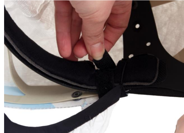
5.3 Remove the Velcro tapes.