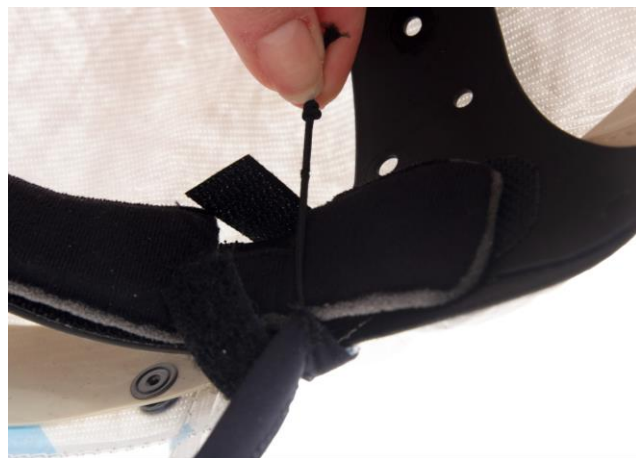
5.2 Release the face seal rubber bands secured to the forehead band next to the Velcro tapes.