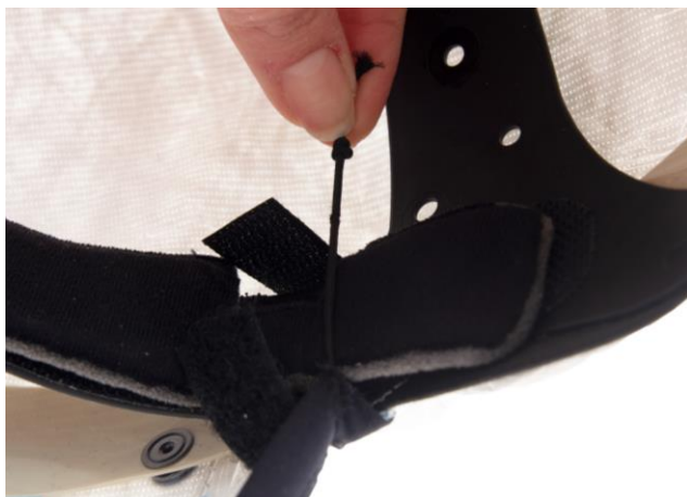
4.2 Release the face seal rubber bands secured to the forehead band next to the Velcro tapes.