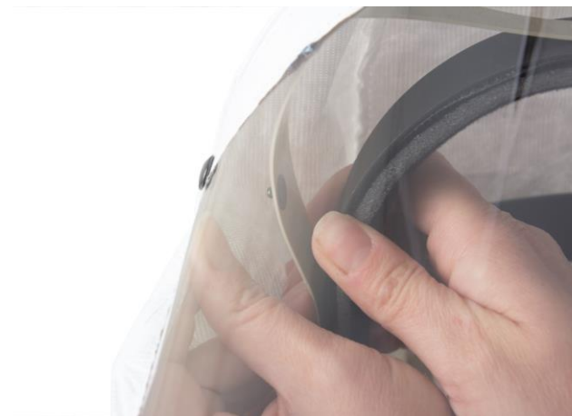
5.4 Release the three press studs at the top edge of the visor Lift the head harness out of the hood.