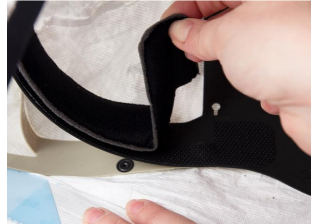
4.3 The sweat band is secured with Velcro tape to the forehead band. Pull the sweat band off.