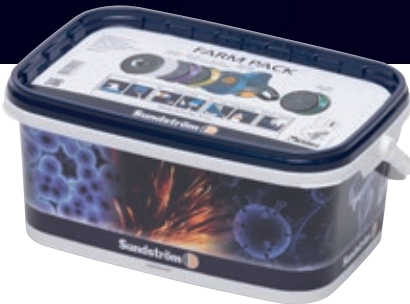
Storage box x1