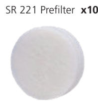
SR 221 Prefilter x10