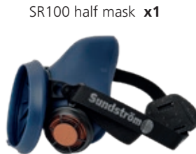
SR100 half mask x1