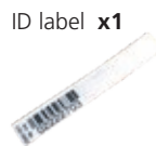
ID label x1

Sundstrom's comfortable half mask respirator lets you work longer with less effort and better protection, and at less cost.