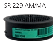
SR 229 AM/MA