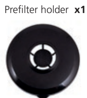
Prefilter holder x1