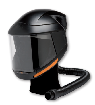
Face shield SR 540 EX