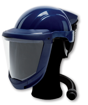
Protective helmet with visor SR 580