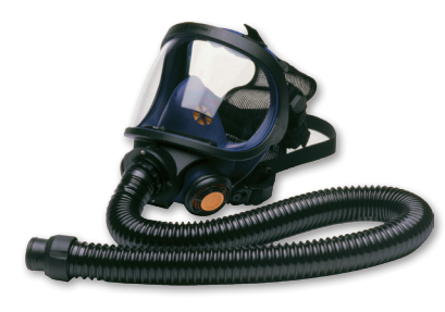
SR 200 with hose SR 550 PU/SR 551 Rubber