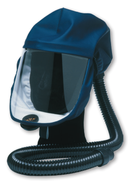
Hood SR 520