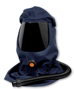
Hood SR 530